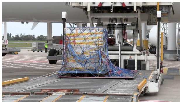
The first doses of Pfizer vaccine arrived at Sydney Airport in February.

Remember, vaccines have special storage requirements (for example, the Pfizer vaccine needs to be stored at minus-70 degrees Celsius), so be particularly vigilant around cold chain or temperature-controlled goods.