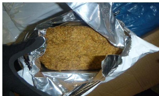
Example of a molasses tobacco detection.