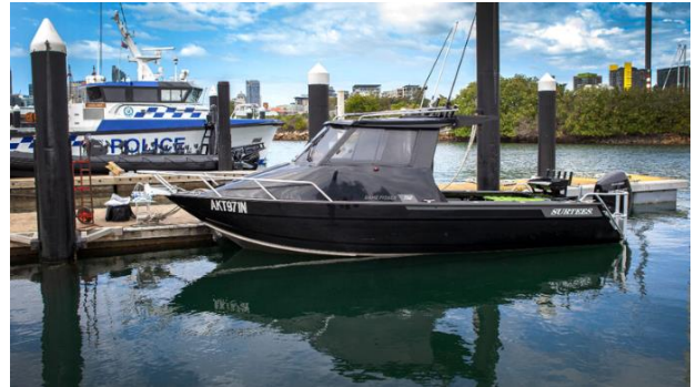
The 'daughter' vessel that was intercepted. A larger 330m 'mother' ship is docked in Port Botany.

On 11 March 2021, approximately 200 kilograms was seized after it was allegedly located on board a vessel off the New South Wales coast. The detection resulted from a joint operation between AFP, ABF and NSW authorities.