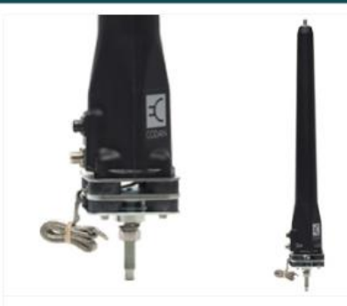
9350 Automatic Tuning Whip